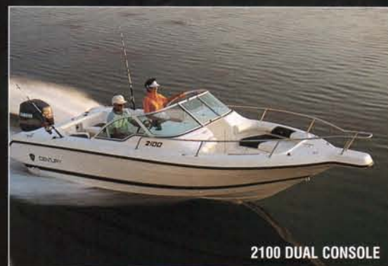
2100 DUAL CONSOLE