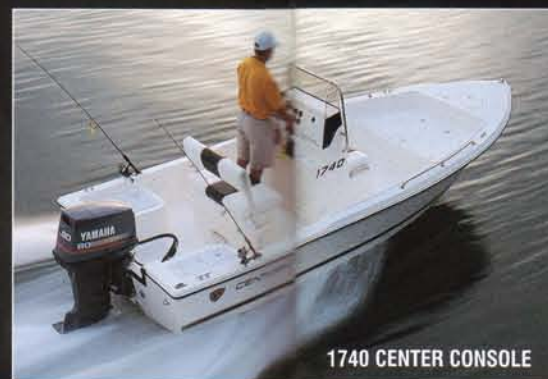
1740 CENTER CONSOLE