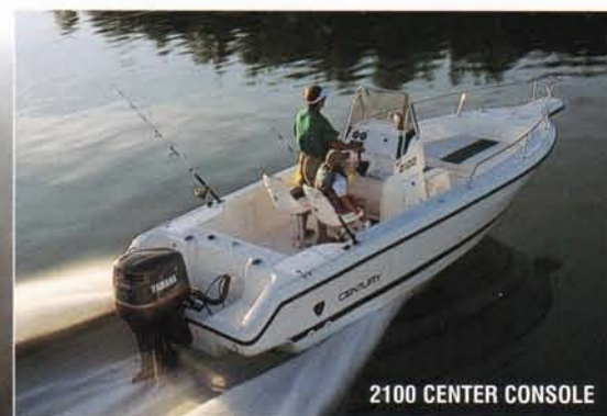
2100 CENTER CONSOLE